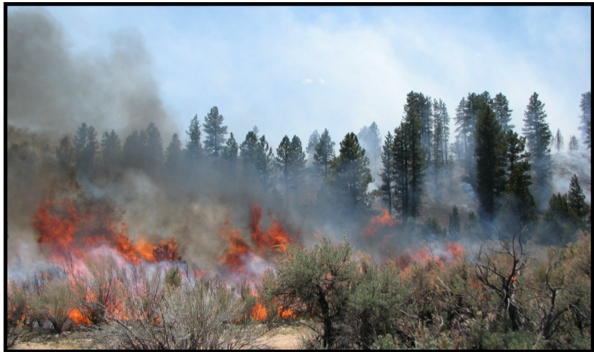
Garfield county - 2011 Fire near Boulder

An assessment takes into account factors such as major economic impact and whether the fire threatens lives and improved property including critical facilities, critical infrastructure or critical watershed areas.